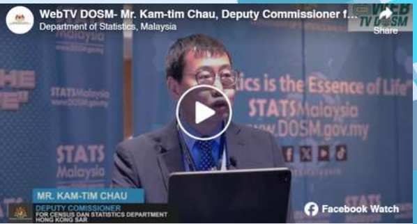
Mr. Kam-tim Chau Deputy Commissioner for the Census and Statistics Department, The Census and Statistics Department of Hong Kong SAR