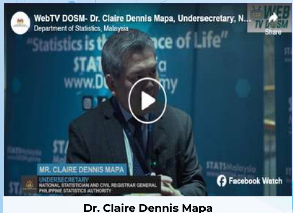
Undersecretary, National Statistician and Civil Registrar General, Phillipines Statistics Authority